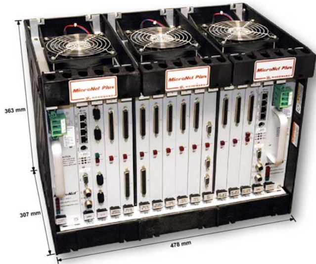
MicroNet Plus Control Chassis (14 VME slot option)