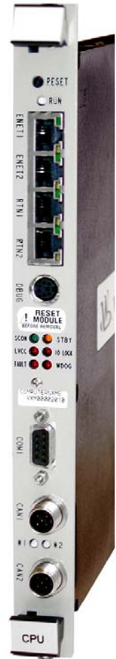
MicroNet Plus CPU5200

The MicroNet Plus system is capable of running in a redundant master / standby configuration to provide higher availability. Synchronized memory assures that both CPUs use the same operating information in every rate group. If the master CPU becomes inoperable, full system control, including control of the I/O, is transferred to the standby CPU in less than 1 ms without affecting prime mover operation. After correcting the master CPU fault, the system can continue running on the standby CPU, or control of the system can be transferred back to the original master CPU. Annunciation of any control transfer is given through communication links.