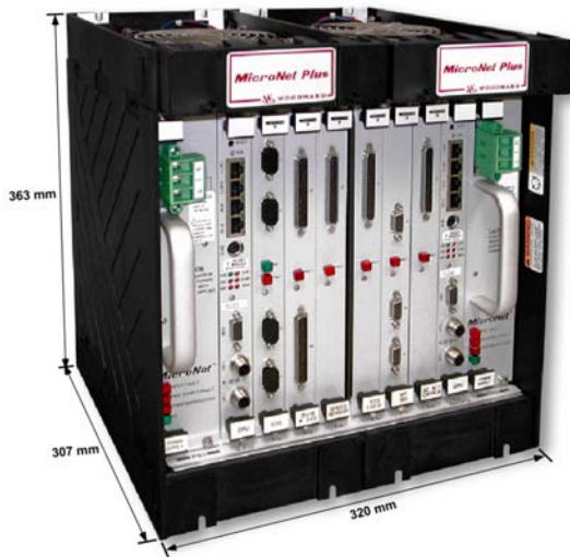
MicroNet Plus Control Chassis (8 VME slot option)

Power supplies may be simplex or redundant in any combination of input voltages.